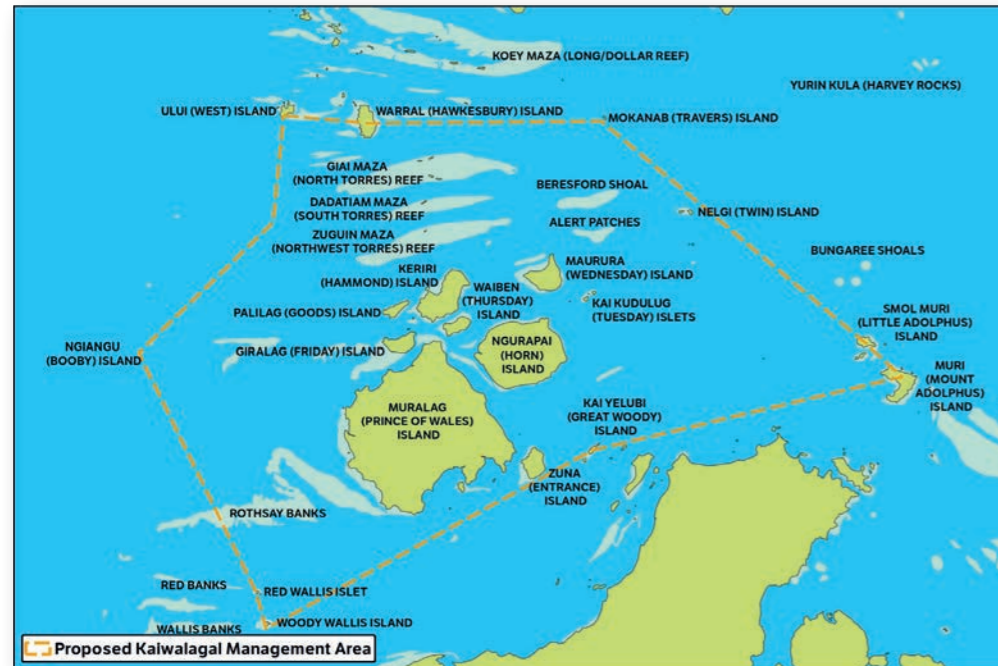
This map is based on the proposed dugong and turtle management area. Dugong and turtle management areas show the general area of operation of community-based land and sea Rangers. The best available information (including traditional place names) has been used at the time of publication. This map is indicative only and not intended for native title purposes.

Native title is recognised over Muralag Island and is held in trust by the Kaurareg Native Title (Aboriginal) Corporation RNTBC.