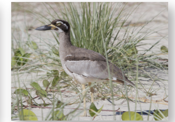
Beach Stone-curlew