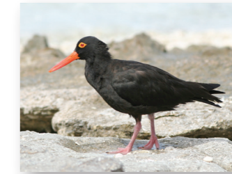
Sooty Oystercatcher