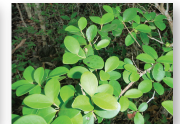
Cedar Bay Cherry